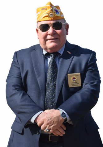
SPRING NEC PHOTOS